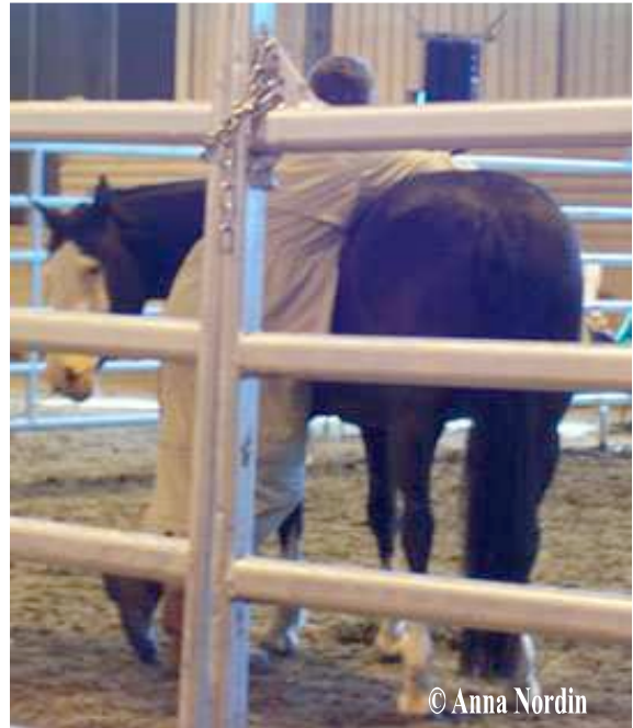
A mare at the clinic. According to Klaus she was overworked and had to learn that human beings do not only mean exhaustion but can also be nice.

- I can only give what I give, ideas and symbols. But afterward I must leave it up to the participants what they make out of it. To change people takes a long time but I have made them aware. Perhaps they will not be able to handle the situation at once, but the new awareness and the time means that they will step by step start to manage. Previously I found it difficult to let them go, but I had to learn to let them manage by themselves. I can only show the way.